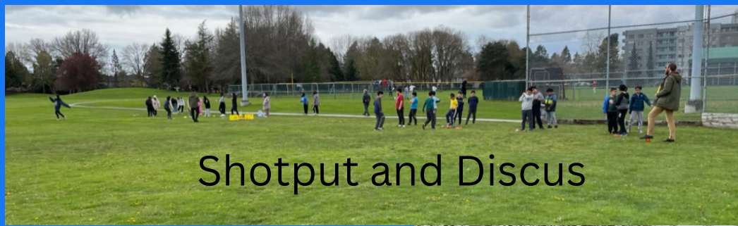
Shotput and Discus