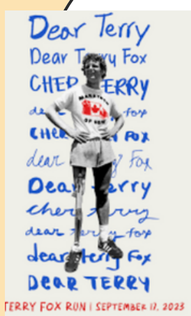
TERRY FOX RUN | SEPTEMBER 17, 2023

First Hot Lunch--must order via MunchaLunch