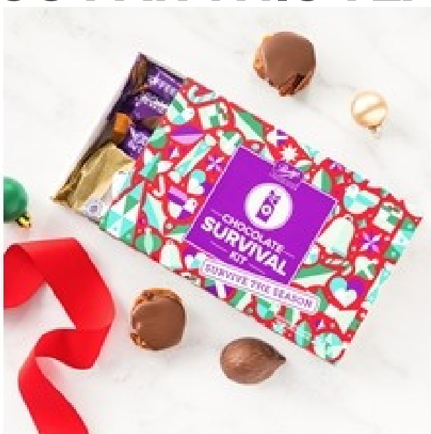
Survive the Season, 5 pc $19.00