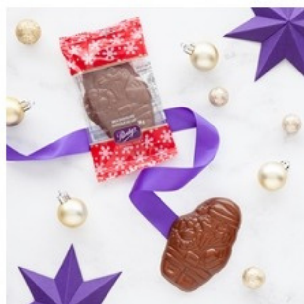
Jolly Saint Nick (Milk Chocolate), 56 g $4.50