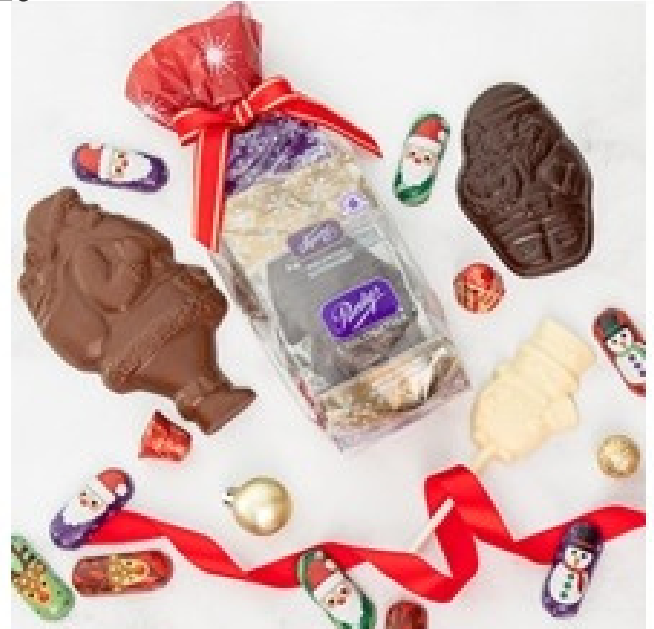
Stocking Stuffer, 235 g $16.00