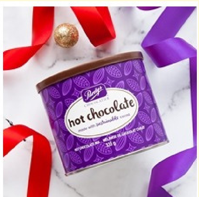
Hot Chocolate , 335 g $9.50