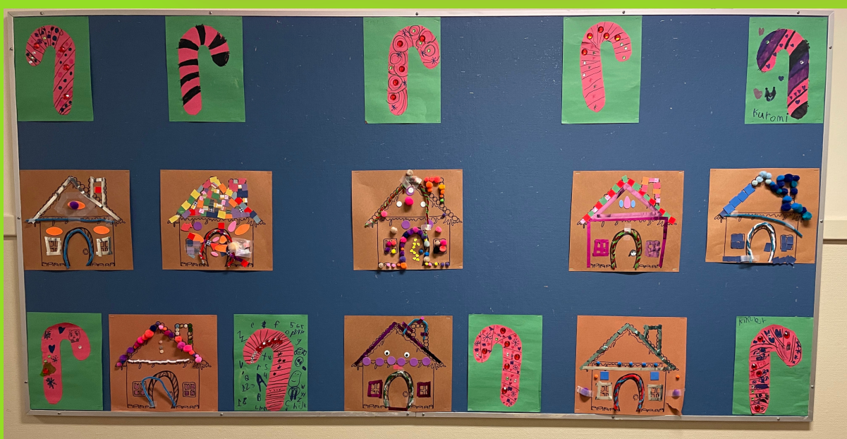
Div. 9 Candy Canes and Gingerbread Houses