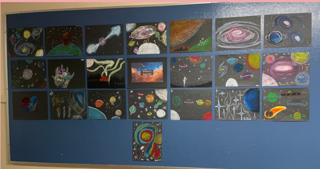
Div. 1 Space Art